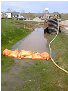
Working to keep erosion control measures in place during construction.