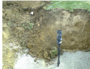
New water service curb box. Each property will receive one.

This week was similar to work that happened last week. Contractor is busy replacing water service curb boxes. These boxes are placed over the valve that allows water to be shut off outside your home. All curb stop boxes have been replaced on Whitney and a few are done on Roselawn. The contractor will move to replacing the bolts for fire hydrants, at Roselawn/ Whitney and Seneca/Whitney. Once all the work on water main and water services is complete on Whitney, the contractor may start installing storm sewer on Whitney. Or they will start on Hiawatha fire hydrants. The contractor would like to stay ahead of the gas company and therefore will jump up to Hiawatha. This work may